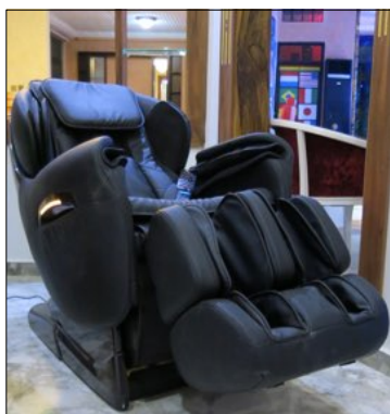
The Zero Gravity Massage Chair

Located next to the Spa are our 'zero gravity' massage chairs - an out of this world experience. Simply select the mode of your choice and enjoy 20 minutes of total relaxation. Who on earth invented this? It's so good, it feels like there are little people hidden in the chair who are expert masseurs.